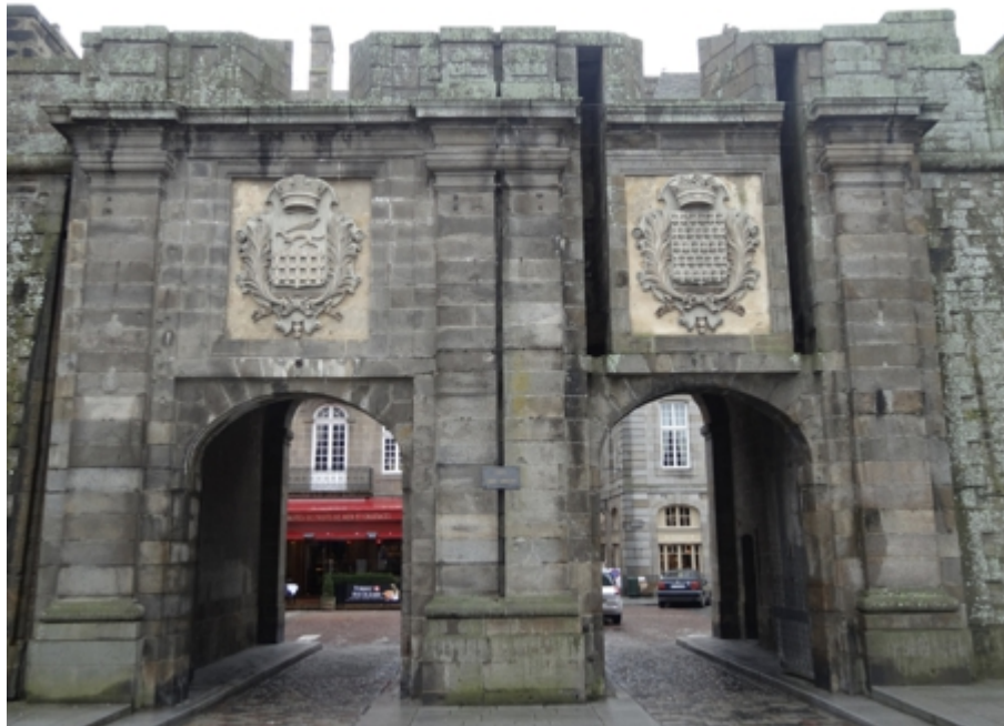
Entrance to the city through the St Vincent Gate

The Liberation of 1944 resulted in the flattening of 80 % of the old town within the city walls, and now after years of painstaking work the old city has regained its legendary skyline. It is the principal port of the north Brittany coast, with the arrival and departure of daily ferries to Portsmouth and the Channel Islands and is a popular tourist destination in its own right.