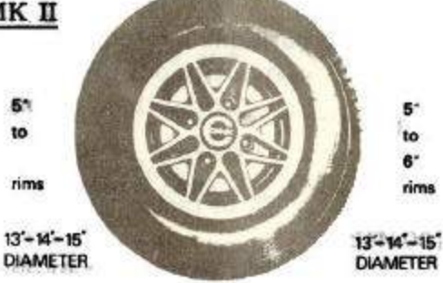
(Mk. II design. Machined linish with black enamel inserts

TOUGH —Immensely strong for Rallying and Racing.